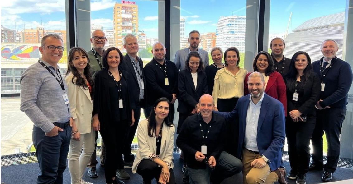
Image: Consortium Members during the Interim Meeting that took place in Madrid.

One of the pivotal topics on the agenda was Work Package 3 (WP3), which focuses on curriculum development. The partners discussed the development of five initial modules and how to move forward. They explored the methods for developing and delivering these modules, which will be hosted on an LMS. Yasar University will play an important role in helping deliver the final curriculum.